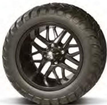
14-inch custom black aluminum wheels with 23-inch all terrain tires or upgrade steel belted radial tires