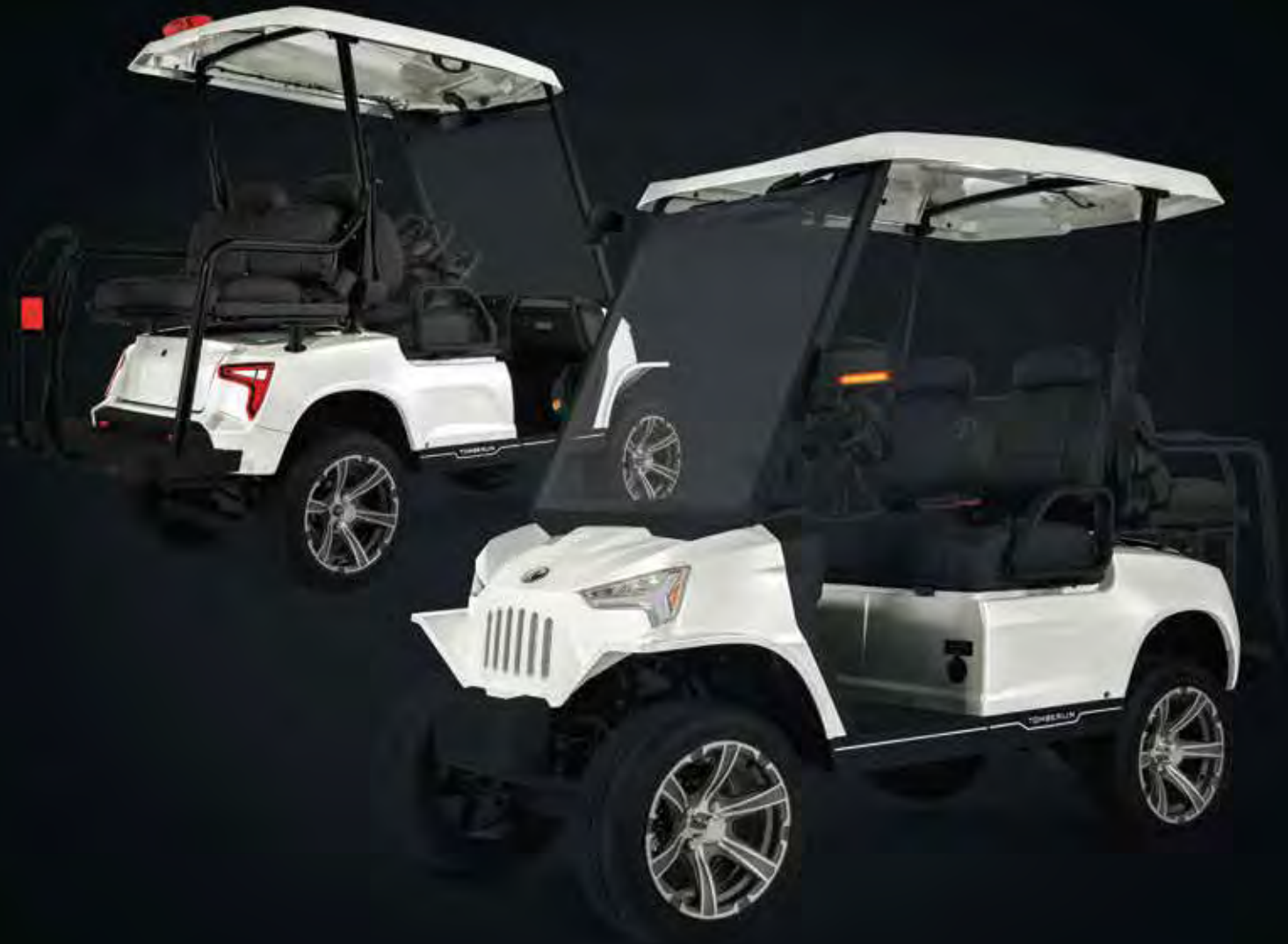
Engage E2+2 LXR shown with White Diamond body and black CoolTouch™ seats. Shown without standard headliner.

©2023 Columbia Vehicle Group. All Rights Reserved. Tomberlin — a brand of the Columbia Vehicle Group, Inc. which is a subsidiary of the Nordic Group of Companies, Ltd., headquartered in Baraboo, WI — is a manufacturer of electric vehicles designed for open neighborhoods, golf courses, master planned communities, and short distance commuting. Since 1984, the Columbia Vehicle Group brands have represented one of the most expansive electric vehicle product line-ups in the world, serving customers in the consumer, commercial, and industrial markets.