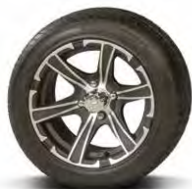
14-inch "T" aluminum wheels with 22-inch steel belted radial tires