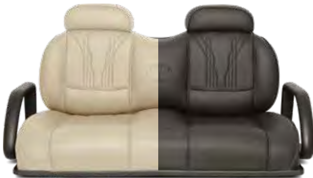
CoolTouch™ Sandstone or Black