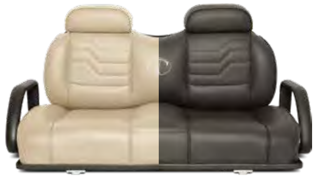
CoolTouch™ Sandstone or Black