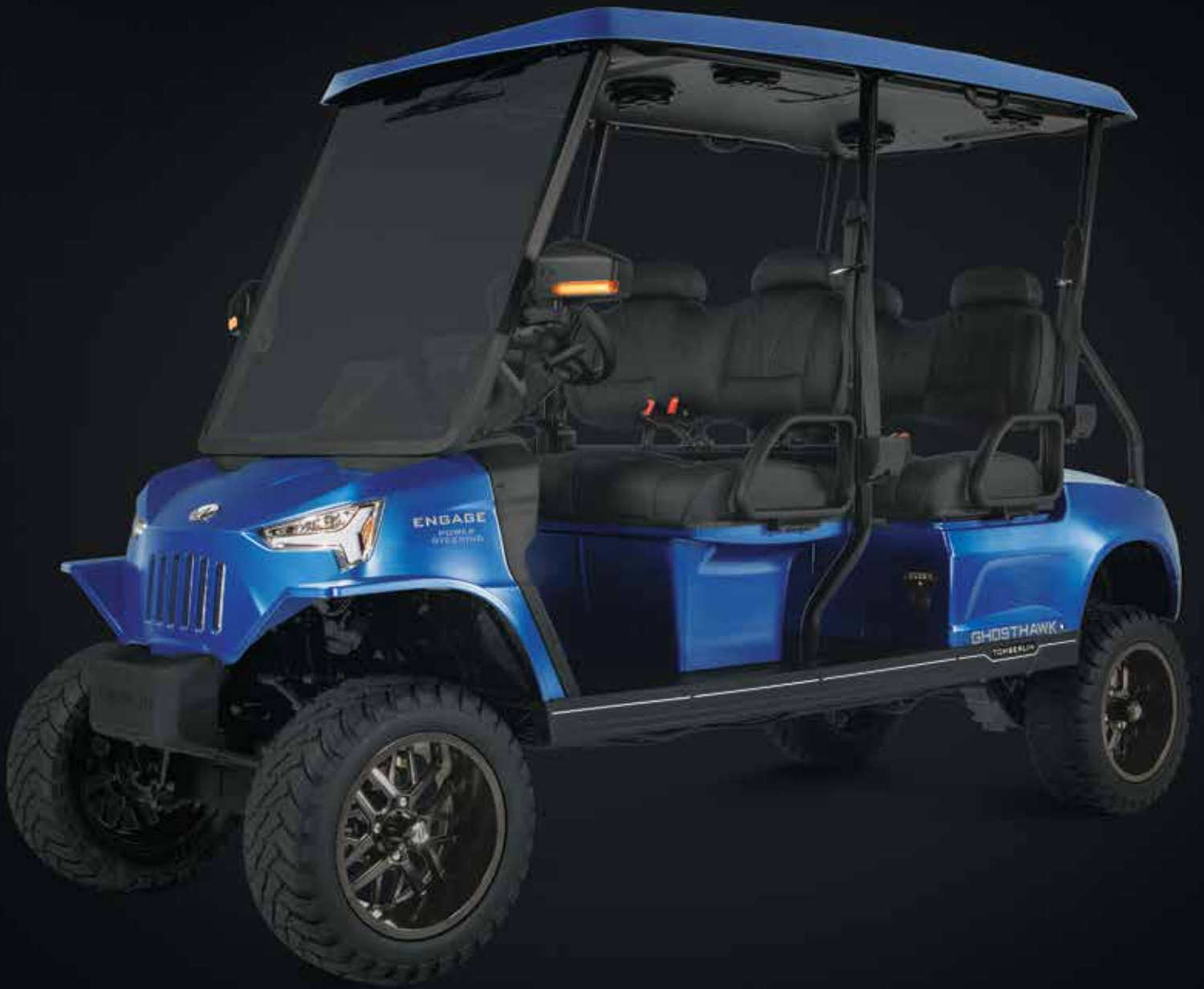
Engage E4 Ghosthawk shown with Matte Lux Blue body and black CoolTouch™ seats.